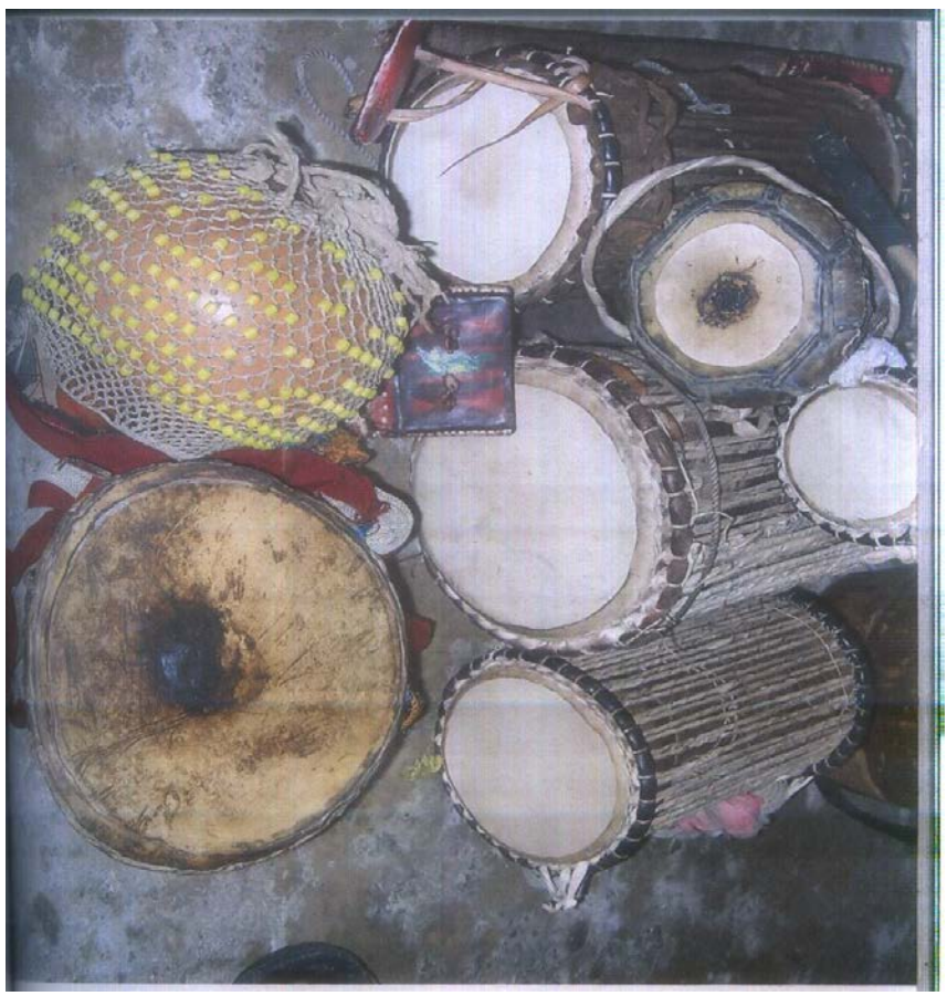
Some Instruments of the Bata and Dundun Ensemble