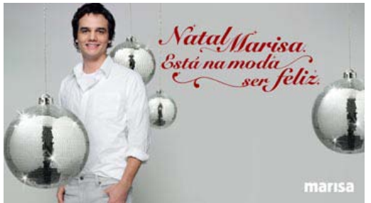
Image8:ChristmasCampaign 2008 - with Wagner Moura