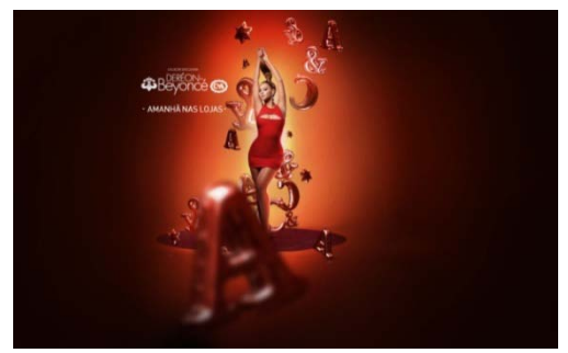
Image2: ChristmasCampaign 2010 - withBeyoncé