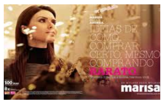
Image9: Campaign 2010 – emphasis on the word cheap.