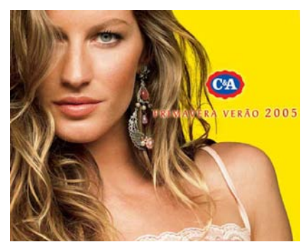
Image3: Spring Summer 2005 Campaign - Gisele Bundchen

The Riachuelo follows the same line of endorsement, but for this brand, even bringing in renowned designers role. All famous personalities endorse used small collections and consequently associate their brand successes.