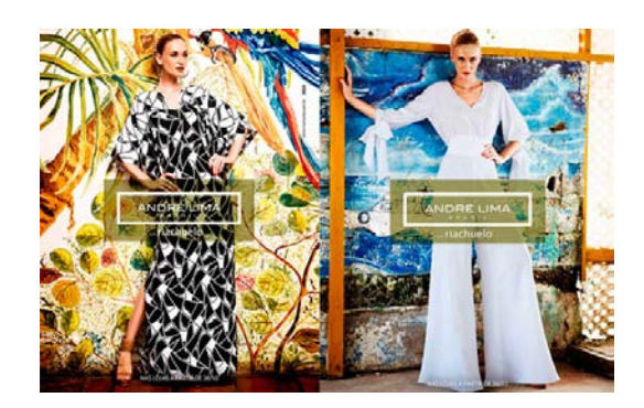
Image5: Campaign 2012 - André Lima