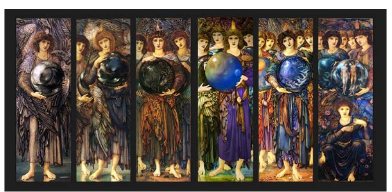
Fig. 2. Edward Burne-Jones, The Days of Creation , 1876, watercolor Fogg Art Museum, Harvard University, Cambridge, MA See also http://www.williammorristile.com/burne_jones_days_of_creation_angels.html