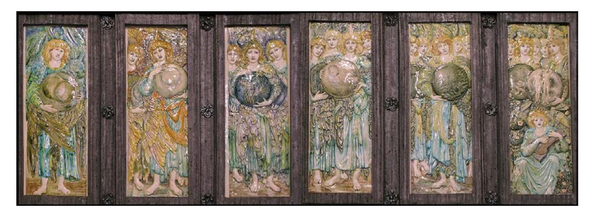
Fig. 4. Edward Burne-Jones, The Days of Creation , 1894, stained glass windows. Chapel, Harris Manchester Hall, Oxford, UK