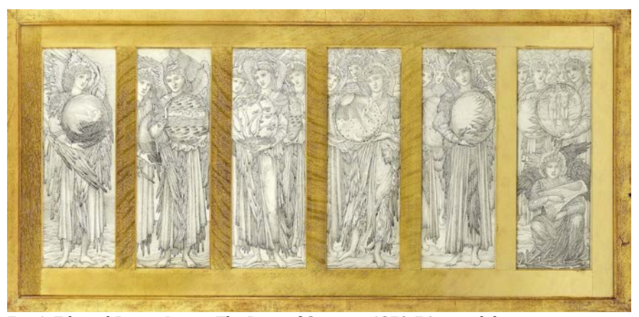
Fig. 1. Edward Burne-Jones, The Days of Creation , 1870-76, pencil drawing Private Collection