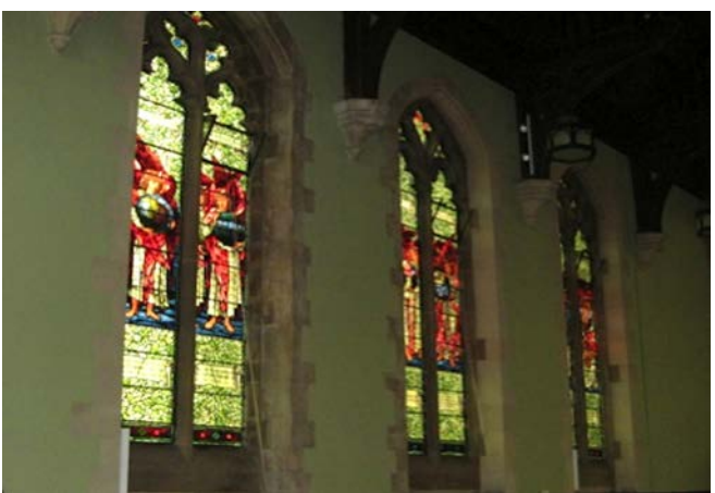
Fig. 5. Edward Burne-Jones, The Days of Creation , 1894, porcelain Saint Dyfrig Chapel, Saint David Llandiff Cathedral, Cardiff, Wales