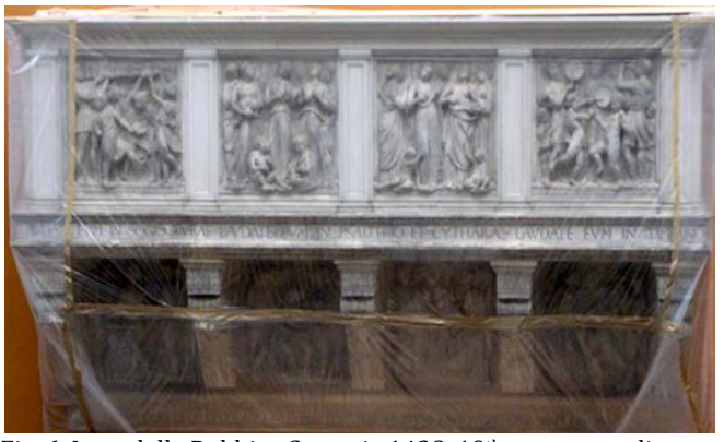
Fig. 6. Luca della Robbia, Cantoria , 1438, 19<sup>th</sup> century replica Victoria and Albert Museum, London