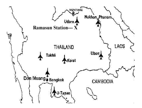
Figure 1.U.S. Air Force Bases in Thailand (Whealley, 2001)

Due to its being a suitable strategic location that was not far from neighboring capital cities in Indo-Chinese countries, UdonThani had been selected in 1964 as the U.S. Air Force base, under the command of the 7th U.S. Air Force Division, that would facilitate military activities during the Vietnam War The Americans selected UdonThani because it could help them reduce their costs of transportation and shorten the flight time required to drop bombs in strategic locations in Laos and Vietnam. Furthermore, it was also a camp from which mercenaries, known as the Tiger Hunters, engaged in battle with Laotian soldiers under the command of General VangPao. The number of American troops steadily increased in Thailand, after the declaration of war by the U.S. government upon Vietnam. UdonThani was also the location of Ramasun Station, which was an important station for spying and top-secret intelligence; it was the largest and most complicated station in the Southeast Asia as well as the second largest in the world, after America's intelligence offices in Augsberg, Germany (Pawakapan, 2006).