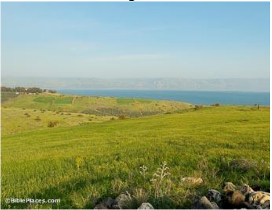
Figure 1. The Galilean level and hillside<sup>26</sup>

In terms of educational policy, this study gives a good insight to the Ministry of Education in Korea. This research strongly suggests that the policy of the more generalized religious education should be adopted. Practicing that education is quite close to a well-developed global standard. Intrinsically, it also goes well with the human rights, more specifically the right to learning of the learners as well as to teaching of the teachers concerned.