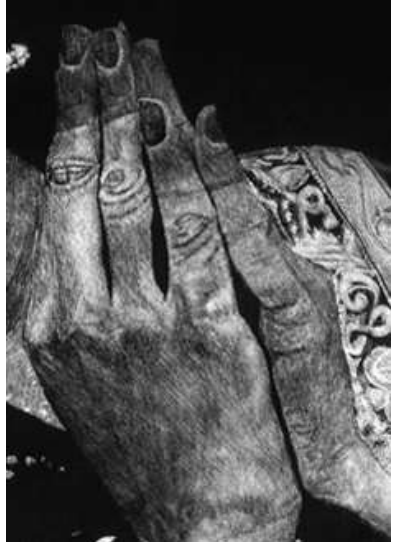
Figure 3: Showing the 'mudra' or 'hastas'- hand gestures. Note the red dye (sometimes henna) covering the finger tips and nails.