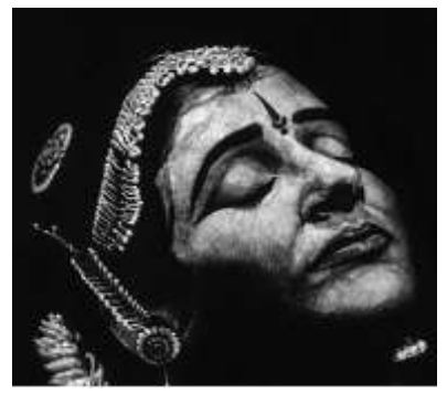
Figure 2: Abhinaya and Bhava or an emotional state of intense devotion. The scratchboard technique of cross hatching has been used for the facial skin using tattoo needles.