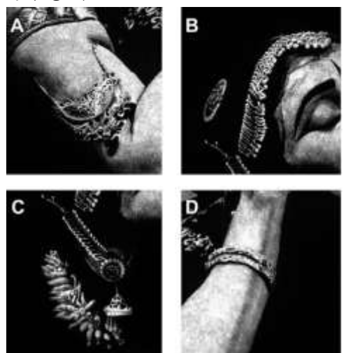
Figure 5: The gold ornaments and precious gems line the hair, ears, neck, arms and waist. Bharatnatyam dancers wear a unique set of jewellery known as "Temple jewellery" during the performance. 'Armlets' (A), 'wristlets' or 'bangles', 'earrings' and 'necklaces'