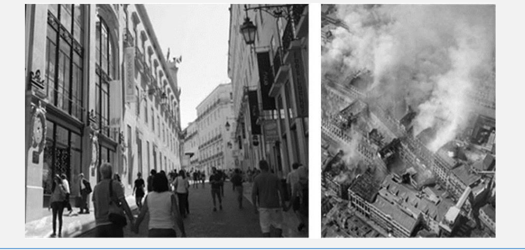
Source: www.casadotinoni.blogspot.com, consulted on 10<sup>th</sup> June 2015, at 3.15 pm.

Fig. 02: (right) Rua do Carmo, today, Source: www.lisbonlux.com, consulted on 10<sup>th</sup> June 2015, at 3 pm. (left) Rua do Carmo Fire.