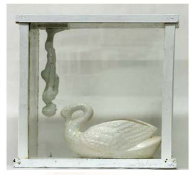
Fig. 2 Dvora Morag, Leda and the Swan, Polyurethane, 2008, 17X35X28cm