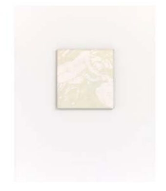
Fig. 13 Joshua Borkovsky, Leda and the Swan, Oil on Canvas, 2008, 45X40cm