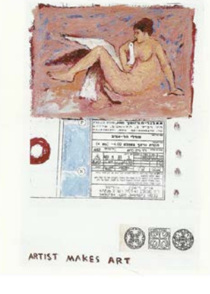
Fig. 8 Assad Azi, Untitled, Acrylic on Paper, 1998, 35X25cm Courtesy of the artist