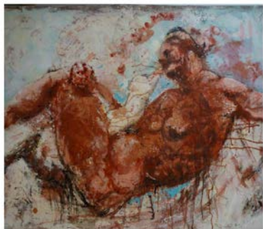
Fig. 9 Gad Apotecker, Leda e il cigno, Oil and ink on linen, 2002, 80X110cm