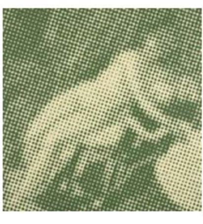
Fig. 12 Joshua Borkovsky, Leda and the Swan, Oil on Canvas, 2008, 140X140cm