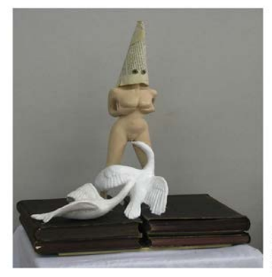
Fig. 1 Dvora Morag, Leda and the Swan, Polyurethane, 2008, 28X45X40cm

Love becomes so illusory, elusive, and unobtainable that everything turns upside-down; and although we have ostensibly disconnected from the Classical world, love in fact returns to being something abstract and mythological, and thereby powerfully returns us back to that world.