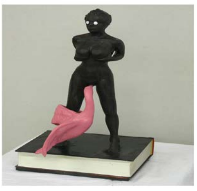
Fig. 4 Dvora Morag, Leda and the Swan, Polyurethane, 2008, 17X48X25cm