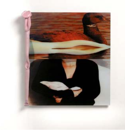
Fig. 3 Dorit Feldman, from the series "Body Art", 1980s, Digital print (restored) and clay object, 60X40X3cm