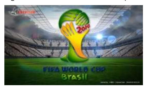
Figure 5: Cooperate Advertising in World Cup

From the perspective of narrative process, this picture adopts players' hands as a theme of this advertisement. It implies a strong strength of people, and expresses the players in the World Cup cooperated together to seek victory. And players will pull themselves together to overcome every difficulty in their battle. When the audiences get this information by sound, they can sense, memorize and imagine their experience, and this process is the results of the audiences observe the outside world and experience the life.