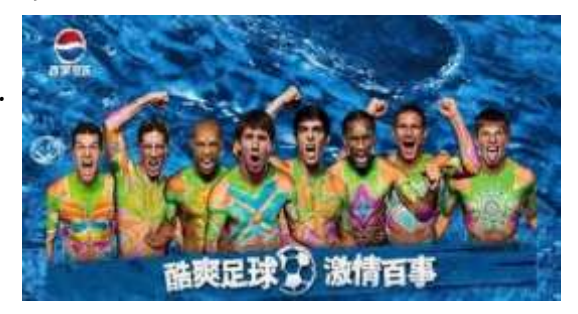
Figure 6: Advertising of Pepsi

In this picture, eight football stars stand together to cheer with their victory, who are surrounded by the Pepsi. The digital letter "8" is a fortunate letter in China, it means "a wish for making a fortune", therefore, the designer choose 8 football stars to participate this advertisement. The viewers are attracted by their cheering or the eye contact and guided them to think it over this drink, which is a representative drink of victory, evoked the viewers' desire to buy it. It is a very important