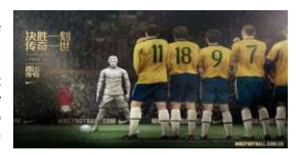
Figure 8: Advertising of "Nick"

Thanks to the effect of the visual communication, the audience can easily get the effect from image. From the perspective of the audiences, this advertisement looks very close to the audiences, but on the other hand, it seems that they are very far from the audiences. By studying the advertisements carefully, it can help to create a relation between the audiences and the speakers.