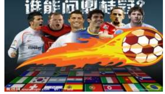
Figure 9: Brand Advertising in World Cup

The brightness of the picture is the main factor. The Figure 10: Advertising of Cup designer should choose the attracting picture to grasp