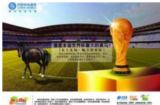
Figure 4: China Mobile Advertisements

space to seek the honor. And the seats imply that the audiences are looking forward to their success.