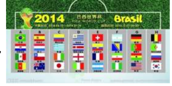
Figure 14: Flags of Advertising in World Cup

Every country in this picture has the same size, which shows that every country in the world has equal statue. This designer promotes the friendship and cooperation of various countries on the one hand, and on the other hand, it highlights the 2014 World Cup's prospective. All of these flags connects together to show the big unity of the world.