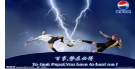
Figure 11: Advertising of Pepsi Cola

In this picture the striking slogan is "To tank Pepsi, You have to beat me!" This slogan means "to Pepsi cans, you have to win me!" The wording contains a provocation but they are specific to the winner of a taste of it, the use of attempting to really urge people to buy Pepsi in various activities to celebrate the victory of the current in order to achieve real business intentions.