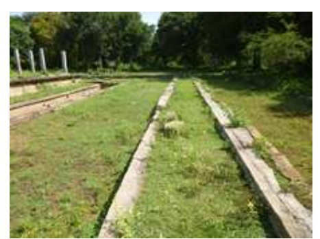
Plate 5: Meditative walkway

A leveled walkway attached to the boundary walls can be identified in most monasteries in western monastery sites. This is allocated for the meditative walk. In multiple monastery complexes like Ritigala, Arankale, Maligatanna and Manakanda have separate meditative walkway as a common to all monastery units in the complex. Generally, walkways have two side boarders made of stone slabs and space between them is rectangular flat surface (about 4'x64') on which stone slabs are laid. At the two ends of the pathway, there are stone slabs