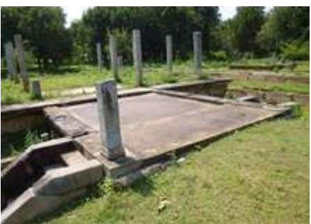
Plate 3: Connecting gangway

Most of the monastery buildings have boundary walls which are rectangular in ground plan. Construction defers place to pace from the range of simple rubble wall to highly finished stone slab