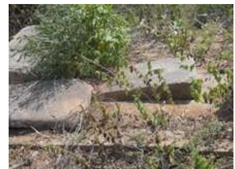
Plate 11: Latrine outside the monastery

Third type is located away from the residential unit. It consists of latrine and in some cases an urinal too. It is a closed type building, but unlike above two groups this does not have any decorations.