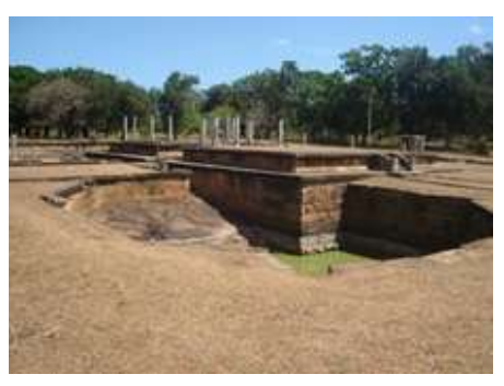
Plate 12: Small pond within the

"For while he (monk) lives thus, should there arise a doubt or confusion in any detail of the subject, he should in time do his duties in the monastery, go seeking alms on Plate 13: Large pond in multiple