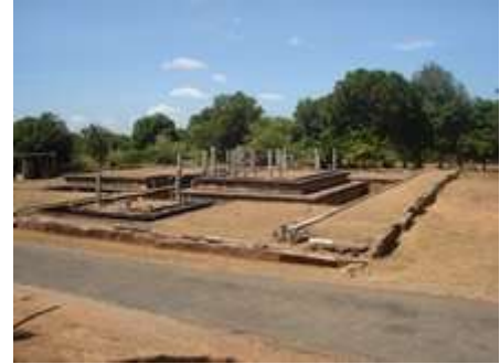
Plate 1: Well preserved meditation monastery in western monastery complex

The main architectural feature of this type of monastery is a double platform structure in the center of monastery unit. These two platforms are elevated structures, front being mostly rectangular in shape without a roof or a superstructure. Front platform is filled with soil or gravel and surrounded by faced stone slabs. The evidences to consider the front platform is open to the sky are the lack of stone pillars or columns on the front terrace and introduction of gargoyles across the side walls of the terrace to drain off the rain water. The rare platform is also a raised structure, generally on an outcrop of a rock. There is archaeological evidence in some sites that the rear structure, rectangular or square in shape, had a superstructure probably a roof. Stone pillars are apparent inside the rear platform and