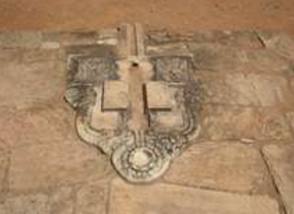
Plate 8: Urinal outside the monastery Plate 7: Decorations of a Urinal