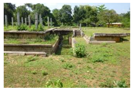
defense to the residential building from wild beast and other rear and front platforms

Moat is an outstanding characteristic in most of the monastery buildings in Western Monastery complex in Anuradapura, where as it is not widely used in other sites. A moat is created artificially around the rear terrace by removing stone volumes from the rock outcrop. Sometimes natural rock dips create at least a part of the moat. Hocart (ASCM 1 1924, 58) proposed that the moat is consequence of attempting to build the residential building on raised rock surface. Paranavithana suggests the moat as a Plate 2: Connecting gangway between